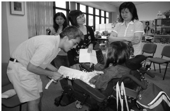
Home Therapy Workshop